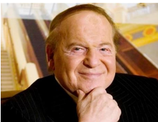
Sheldon Adelson $77.9m

The Top Eight Conservative Donor Families and Their Political Donation Muscle