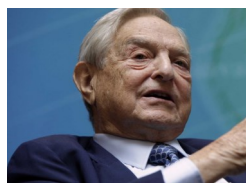
George Soros $20.6m