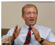
Thomas Steyer $89.7m

The Top Eight Progressive Donor Families and Their Political Donation Muscle