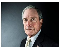
Michael Bloomberg $23.7m