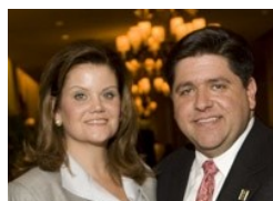
J.B. & M.K. Pritzker $18.9m

"I do think there are certain times we should infringe on your freedom."